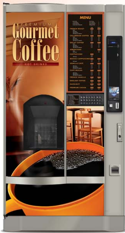
MODELS 673 FB, 675 FD, 677 FB w/Grinder